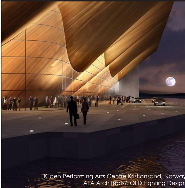
Kilden Performing Arts Centre Kristiansand, Norway ALA Architects/JOLD Lighting Design

http://integrateddesignlab.com/Seattle/Contact/contact.html